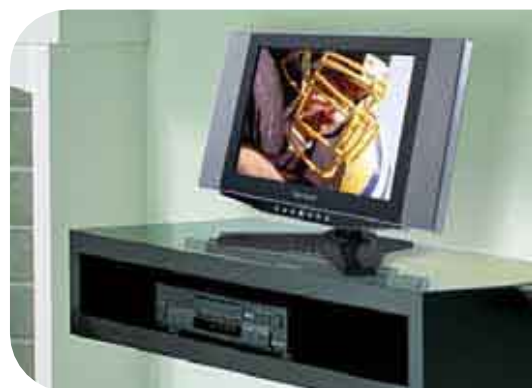
The wide-screen N1750w LCD TV brings brilliant TV to virtually any room in your home.

With the N1750w LCD TV, your easy chair may be the best seat in the house.