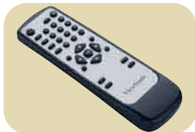
You'll never have to leave your seat with this 51-key remote control.

Perfect as a monitor up to 1280x1024 resolution or as a TV supporting up to 1280x768 high definition.